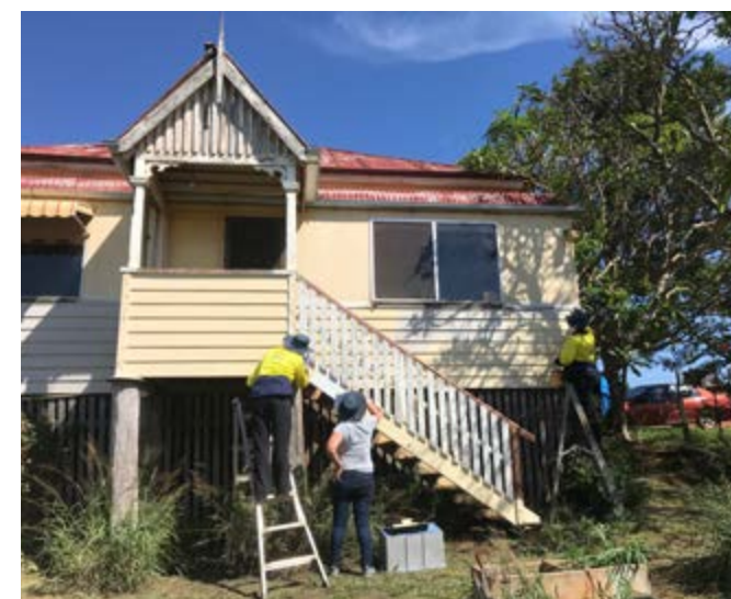
Kingaroy, Drought & Flood Program volunteers

Like all of these projects the community events always had the greatest impact, reducing social isolation and bringing hope back to communities.